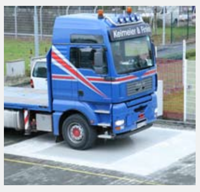
We reserve the right to alter product information without any obligation.